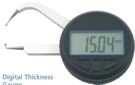
Digital Thickness Gauge