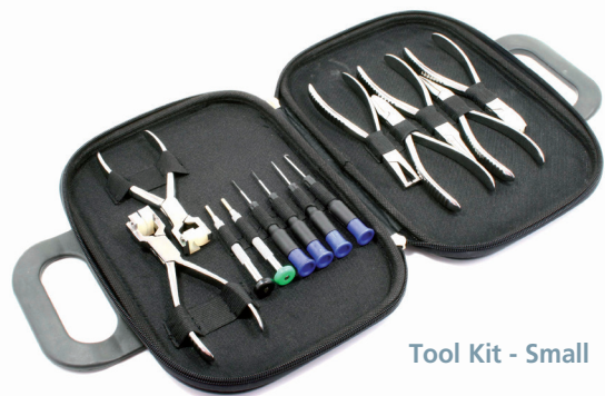
Tool Kit - Small