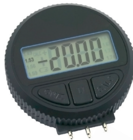
Digital Curve Clock